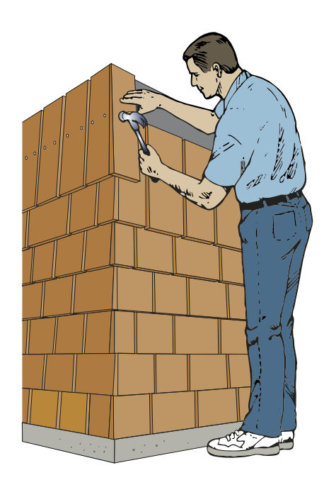
Figure 9: Fitting Laced Corner Courses