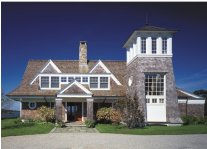
Figure 6: Single Coursing

Note: All figures depict shingle applications. DO NOT interlay shingles or shakes with felt on sidewall applications.