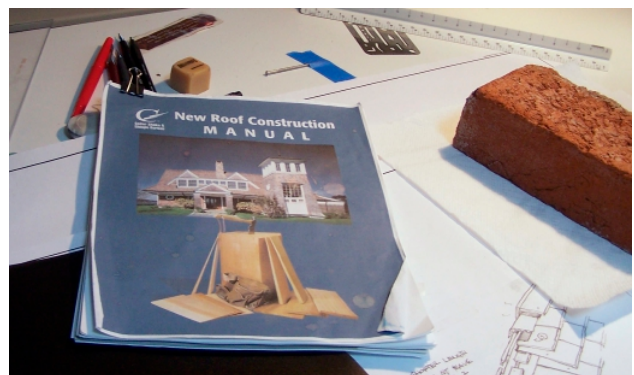
A well-worn, internet-downloaded CSSB New Roof Construction Manual was an integral part of the design process

As most people are aware, a home renovation is akin to adding another full time job to one's existing schedule. Both homeowners work full time, and they opted to live in the house while the renovations were being completed. Naturally, a speedy completion date was imperative, however, not as important as top quality design, materials and workmanship. As the homeowners so aptly stated, "...disposable housing and shoddy workmanship were not our vision." When the CSSB team interviewed this delightful couple, the homeowners' enthusiasm for a period recreation was quite apparent; their kind nature, willingness to learn as well as an appreciation for craftsmen's skills all combined to make spectacular results possible.