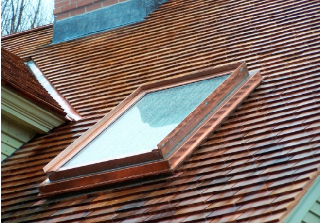
Copper skylights provide a unique, historical look