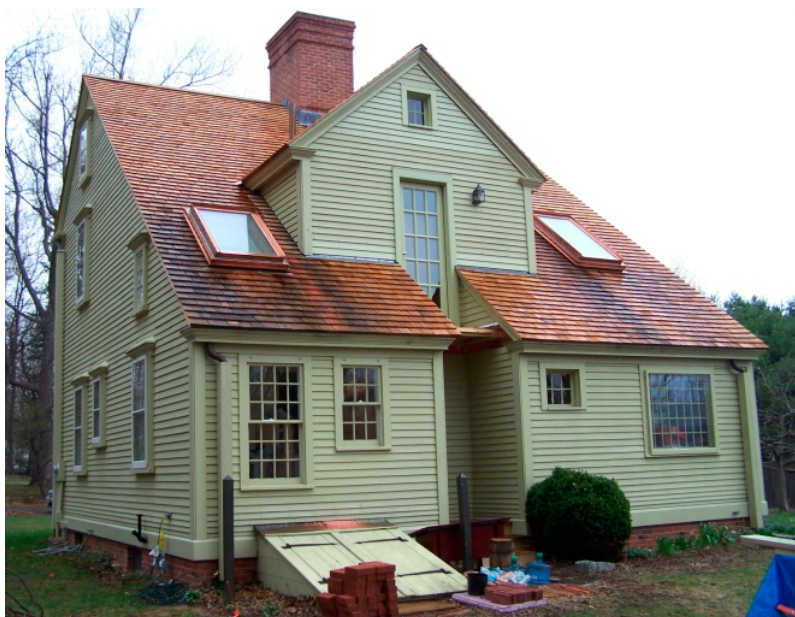
View from the backyard

The homeowners readily admit this project consumed far more time than they initially expected. However, they have a beautiful home that is true to American history and the Georgian saltbox style they adore. Their home also garners compliments every day. And people aren't just saying nice house ... everyone who looks says it's beautiful .