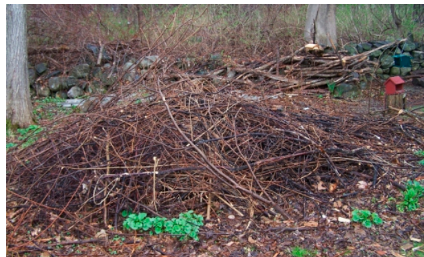
An outdoor brush pile provides refuge for small birds and chipmunks