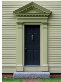
A welcoming entrance

At the end of a quiet residential street, bordered by a forest and a colonial-era, stone wall made about 1740, stands a saltbox design home currently undergoing a complete exterior and interior makeover. The homeowners are clearly fascinated with United States history, and wanted their remodel project to be an authentic recreation of a circa 1750 home. The Cedar Shake and Shingle Bureau ("CSSB") was privileged to have the opportunity to visit this jewel of a project. Of all the projects the CSSB team has seen over the years, this one stands out due to the homeowners' relentless drive for quality and historical accuracy.