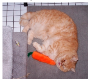
Zoe the cat

When the entire on site crew retreated inside from the drizzling rain to view project drawings, a couple of curious onlookers made themselves known. Zoe and Granville, the two lovely resident short hair Persian cats, were slightly amazed at the c o m m o t i o n around the job site. Their initial skepticism was soon replaced by relaxed lounging that was, as the crew believes, largely due to the comfort provided by their new, insulative Certi-label™ cedar roof!