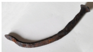
18th Century nail

The Jackson House in Portsmouth, New Hampshire, was being renovated and the homeowners happened to be visiting that day to conduct historical building research. When they discovered that the 18th century, wrought head nails were being discarded, they took a few home for reference. Modern fastener reproductions made by Tremont Nail were purchased; they look just like the 250 year old nails from New Hampshire. The homeowners loved the look and consider it a detail so important to houses from this era.