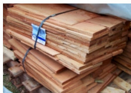
A&R Cedar, Inc.'s Certi-Sawn® shake product at the jobsite

The homeowners initially met resistance when they requested hand driven nails; they refused to budge and ended up making believers of the installers! Hand driving nails gave the installers more confidence in finding that "sweet spot" into the sheathing and allowed them to better control the installation process. As the