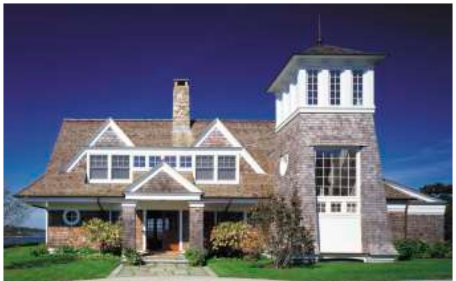
Architect: Shope Reno Wharton

Currently the only acceptable solid sheathing product tested for use with Certi-label shakes is plywood.