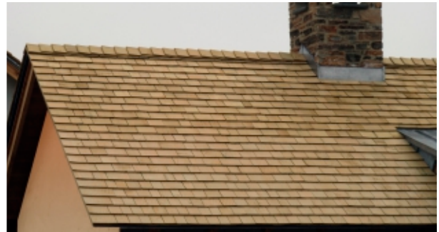
A finished Certi-Sawn® yellow cedar tapersawn shake roof