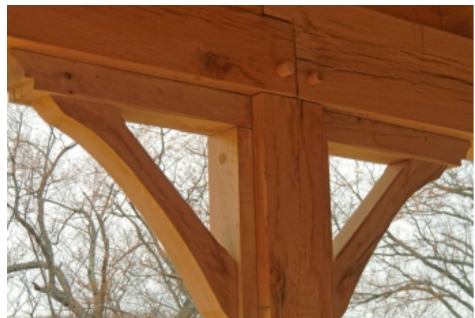
Heavy oak timber beams will age gracefully in place, exactly what the owners wanted

One only has to step a few feet over the chunky clay and shale to experience real craftsmen at work. They love the opportunity to create something special with Mother Nature's finest stone and wood. Elements that make this project unique are the numerous types of trim and siding designs that are discussed on a weekly basis. No compromises are made and a full discussion amongst architect, builder and owner is completed to the team's satisfaction. Everyone works with a high level of trust, and having the opportunity to observe teamwork in action is a pleasure and is a great thing to learn from this case study project.