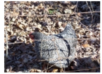
A resident of the 5-acre property