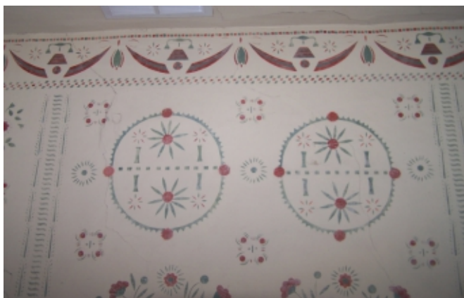
Intricate stencils uncovered during restoration work

Likely the most wonderful part of this home is its ties to the past. Every year seems to bring another