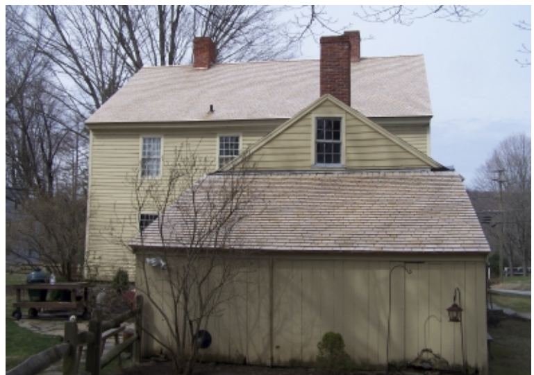
Exterior of home

Today the homeowners look back on their 30-year restoration project and smile, saying that when they began to restore the home, they, "...fortunately didn't know what they were getting into." They knew they had a gem on their hands, a wonderful piece of history that they could preserve. What was unknown