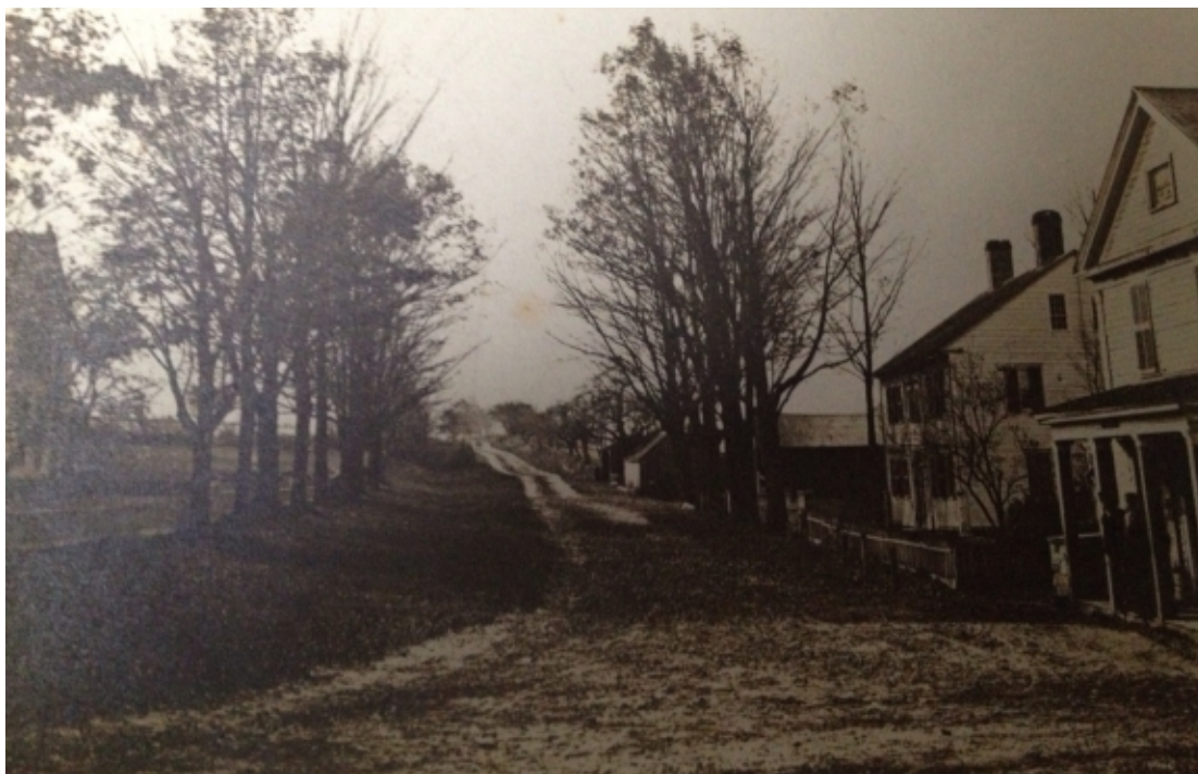
Humble beginnings of an historic legacy