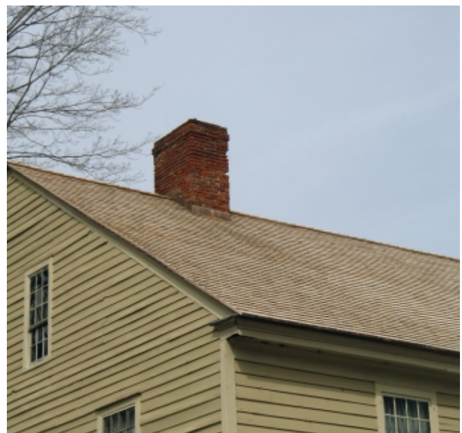
The finished Certi-Sawn® roof

Excavating the privy is on the to do list. While it might seem like a bit of an unpleasant task, 90 years of composting have done the job. Shards of glass have already been found in the south herb garden, and who knows what might be found in the privy itself. The second owner of the house was a reputed glass factory owner in the 1850s and one would assume some of his factory's handiwork was brought home for use. Other historical privy sites have turned up jewellery and ladies' hair combs... this is another mystery waiting to be solved.