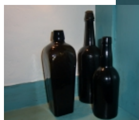
Antique bar bottles

bar, from which spirits were served to weary travellers. Two counter window-bars were found in the attic and the basement, and matched back to their original place when paint was stripped off the floor. Further evidence that this home once served as a tavern is seen in an original, beautifully scripted invoice for the purchase of rum; the tavern establishment met its end about 1840, when the town passed temperance ordinances.