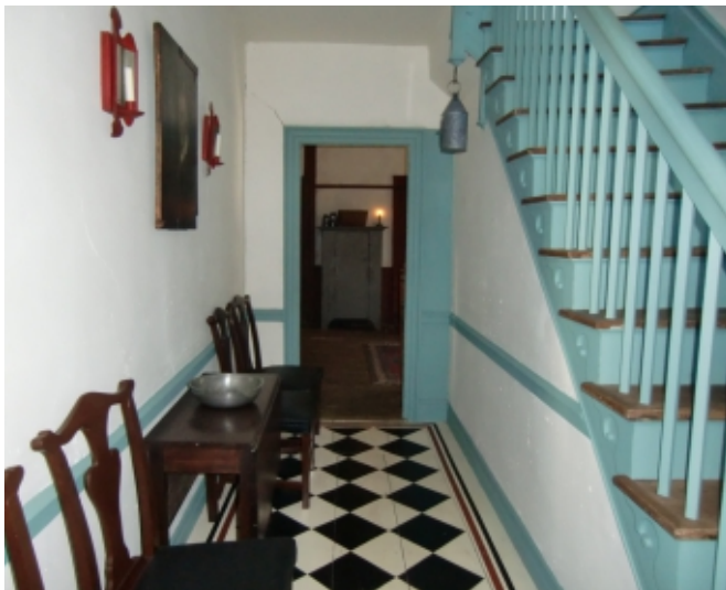
Antiques on display

When the homeowners first purchased the home, it had one 1920s-era bathroom. There was no central heating and the pipes had cracked over time due to cold weather and lack of use. Frost would form on the interior of windowpanes and after coming home