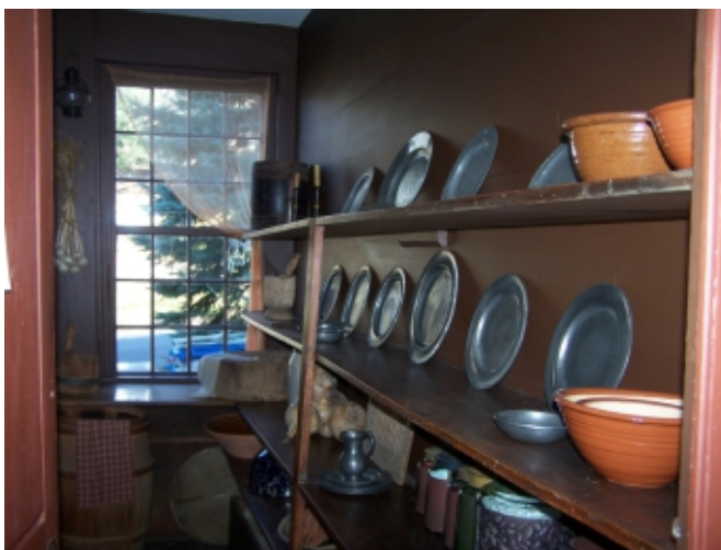
Larder with antique pewter plates