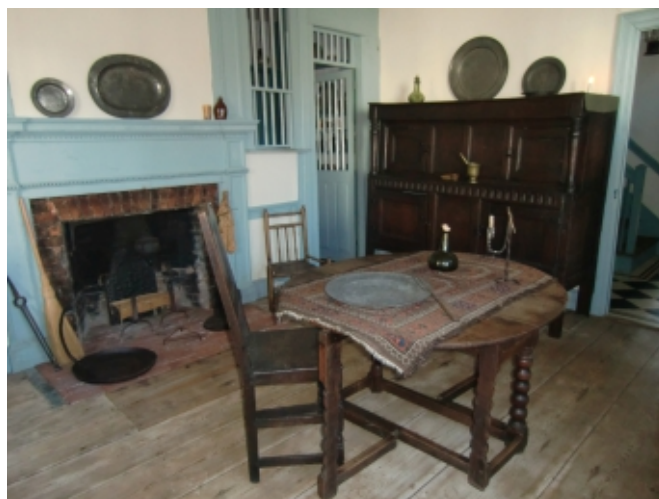
A former tavern seating area