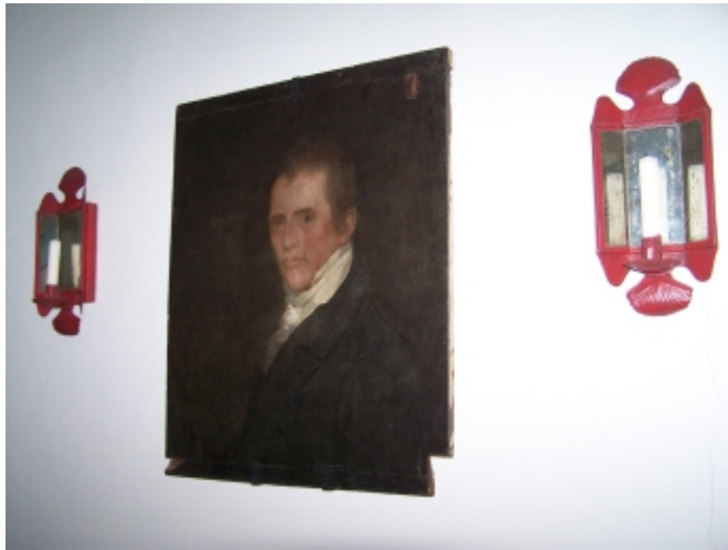
Rediscovered portrait of a former owner

from work in 1979, the homeowners stoked the wood stove to heat the room. Today, the home boasts new plumbing and wiring, yet all done in a manner sympathetic to the home's original character. Various antiques are on display throughout the home, many placed as per the head of household's inventory list from the early 19 th Century. Everything has its place out of necessity, likely because one census record shows a total of 14 people occupying the house!