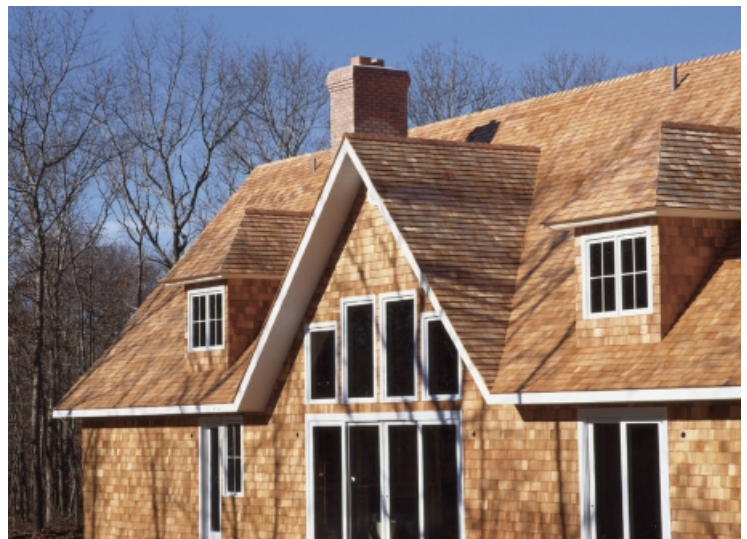
Architect: 3D Building, Photo: David Reeves Studio, Inc.