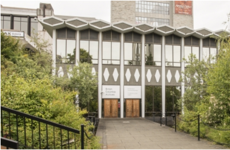
Image of Archives Entrance