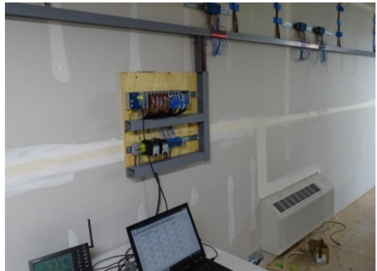
Interior of Ventilation Test Structure showing array of sensors feeding various key measurements into laptop for data logging.

The CSSB Ventilation Test structure is standing tall in York, PA! Housed on the Intertek Testing Services NA Ltd. grounds, this extensive multi-year test will provide detailed information about the moisture and temperature effects of various cedar roofing systems, using a variety of underlayments/non-permeable membranes and continuous ventilation products. We are nearly finished sensor calibration and after that the real data logging will begin. Many marketplace participants, including architects, builders and roofing contractors, have already expressed keen interest in obtaining the results. We're glad to hear so many people consider the CSSB's investment in science to be money well spent!