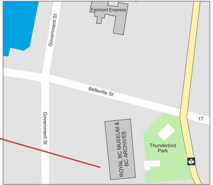
Map reference: Google Maps

Members, the BC Archives at the Royal BC Museum is hosting a small display of our archival collection in its foyer from October 1 – December 31, 2018 in Victoria, BC. As you have learned over the past couple of years the CSSB donated its precious archival collection of 100 years of history to the BC Archives. It was a very satisfying experience as the only collection of its kind in the world is now housed in a secure, climate controlled environment, protected for the benefit of future generations.