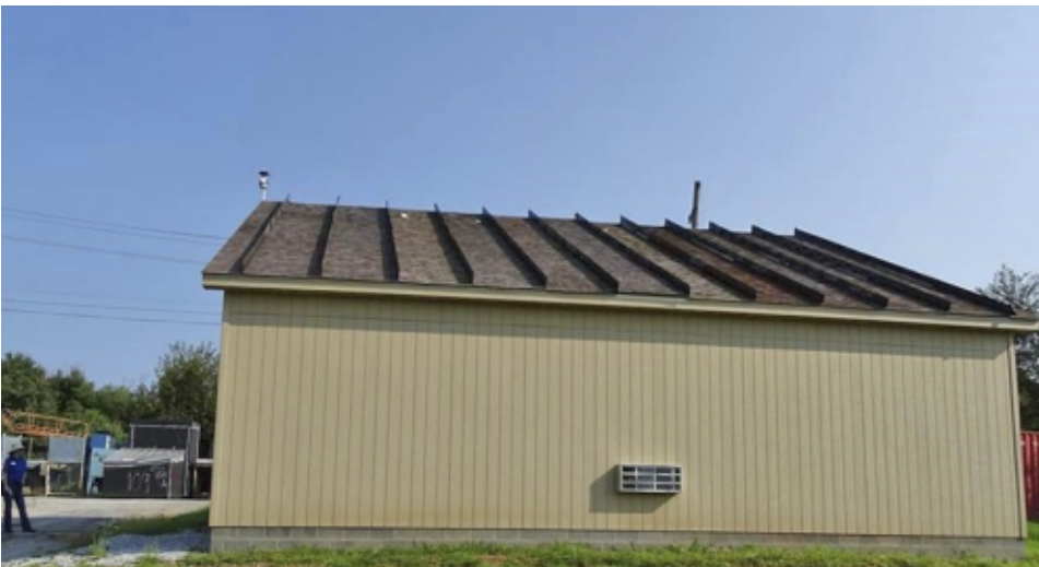
Ventilation test structure = real world testing